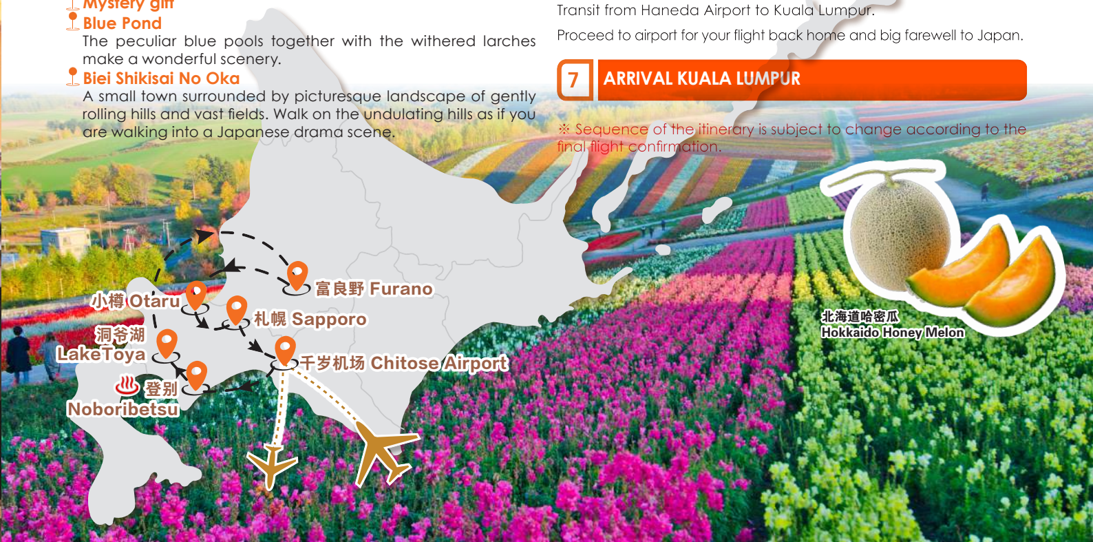
北海道哈密瓜 Hokkaido Honey Melon

※ Sequence of the itinerary is subject to change according to the final flight confirmation.