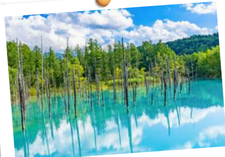
青池 / Blue Pond