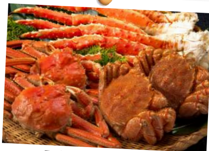
三大北海道螃蟹任吃 / 3 Kind Hokkaido Crab & Buffet