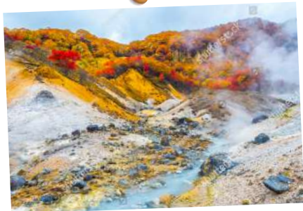
登别地狱谷 / Jigokudani