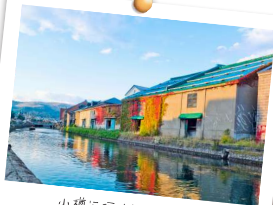
小樽运河 / Otaru Canal